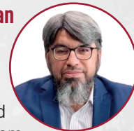
Chief Executive Officer | (PQGTL)